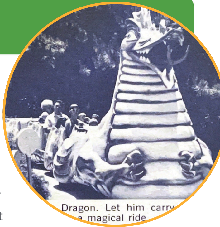
Dragon. Let him carry a magical ride

Danny the Dragon has been a tool for playful engagement for the community. It's Danny's footprints that lead guests to the Entry Plaza of Happy Hollow, and who has served as a mascot for the park & zoo for over the past six decades.